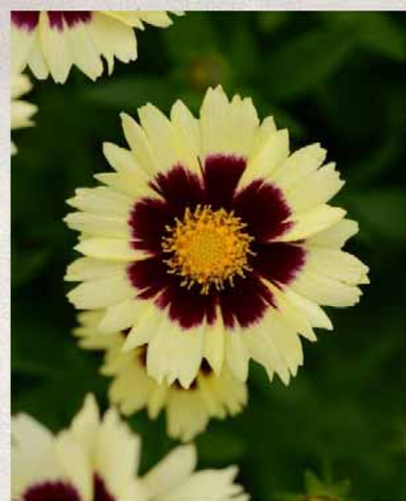
Cream & Red ('Balupteamed' PPAF)