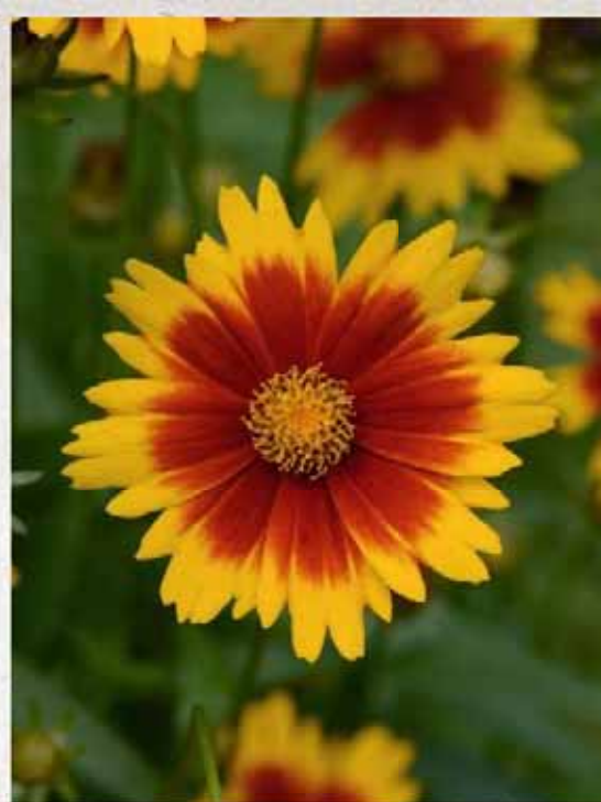
Gold & Bronze ('Baluptgonz' PPAF)