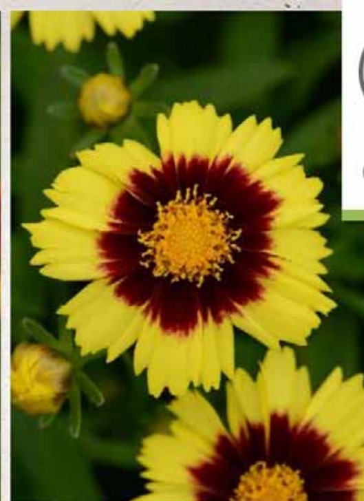
Yellow & Red ('Baluptowed' PPAF)