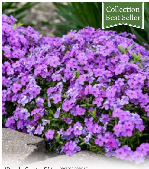
'Purple Sprite' Phlox PP31272 CPBRAf