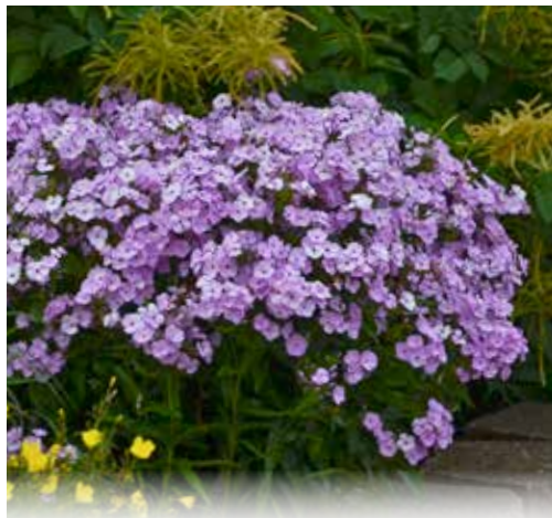
'Opening Act Blush' Phlox PP27462 CPBR5991