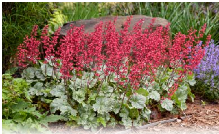
DOLCE® 'Spearmint' Heuchera PP31281 CPBRAf