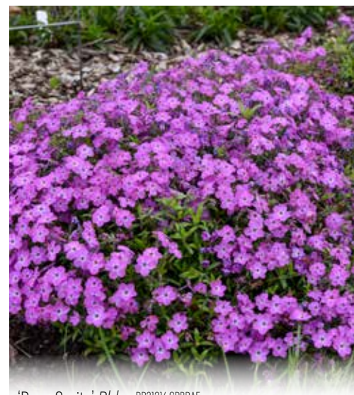
'Rose Sprite' Phlox PP31214 CPBRAf