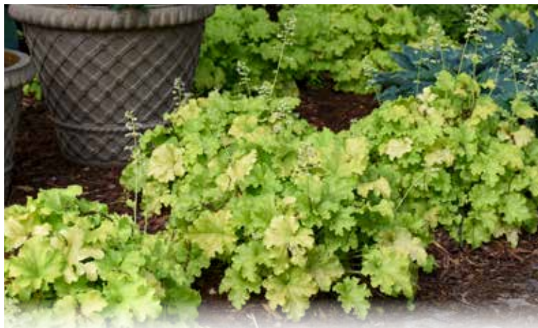
DOLCE® 'Apple Twist' Heuchera PP31221 CPBRAf