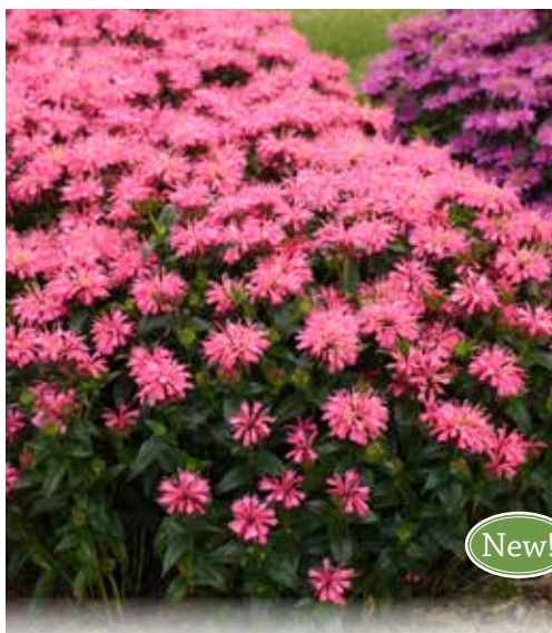
UPSCALE™ 'Pink Chenille' Monarda PPAF CPBRAE