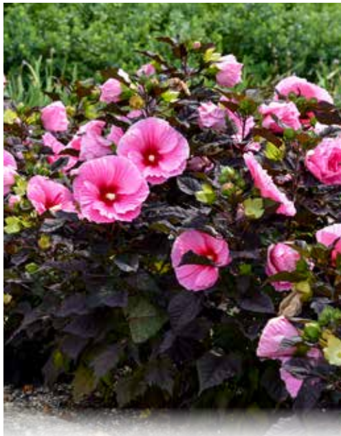
SUMMERIFIC® 'Edge of Night' Hibiscus PPAF CPBRA