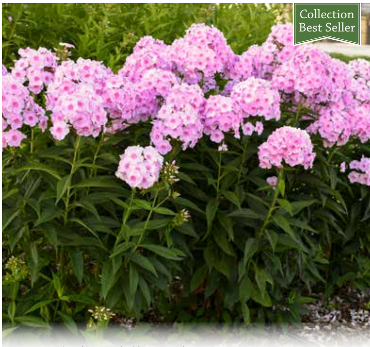
LUMINARY™ 'Opalescence' Phlox paniculata PP33295 CPBRAf