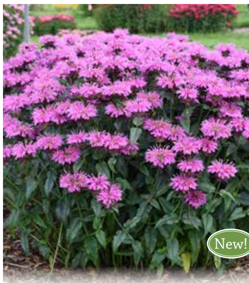
UPSCALE™ 'Lavender Taffeta' Monarda PPAF CPBRAE

Exposure: Light or Filtered Shade | Blooms: Midsummer Zone: 4-9 | Height: 28-34" | Space: 24-28"