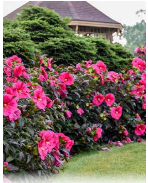
SUMMERIFIC® 'Evening Rose' Hibiscus PP33366 CPBRA