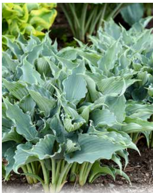
SHADOWLAND® 'Waterslide' Hosta PP30303 CPBR6261