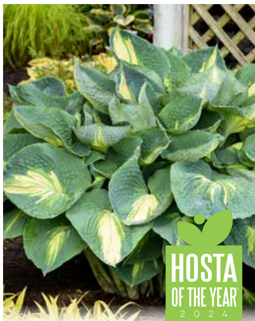
SHADOWLAND® 'Hudson Bay' Hosta PP23598 CPBR4947