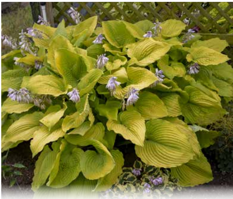
SHADOWLAND® 'Coast to Coast' Hosta PP26469 CPBR5335