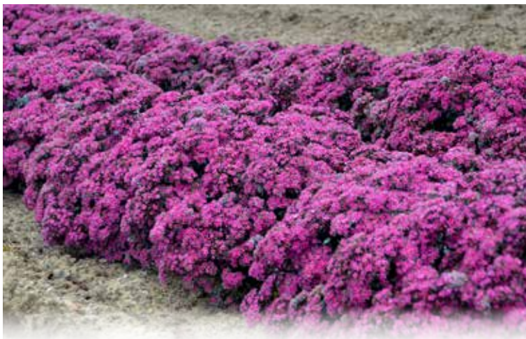
ROCK 'N ROUND™ 'Superstar' Sedum PP31547 CPBR6265