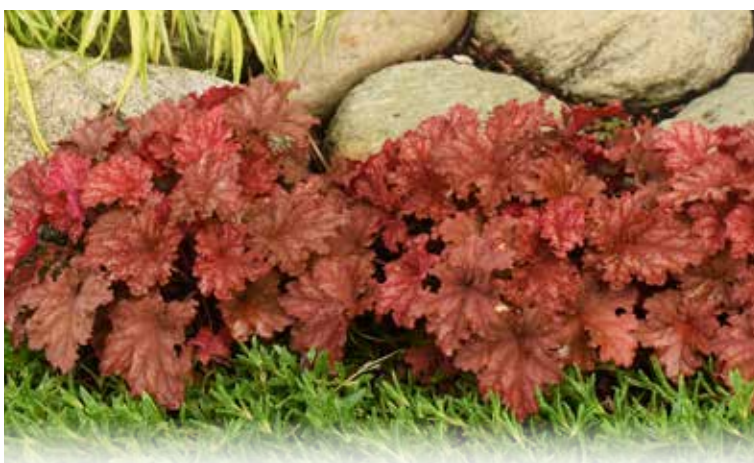
PRIMO® 'Peachberry Ice' Heuchera PP31433 CPBRA7