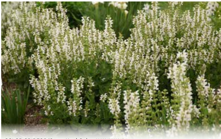
COLOR SPIRES® 'Snow Kiss' Salvia PP32848 CPBRAAF