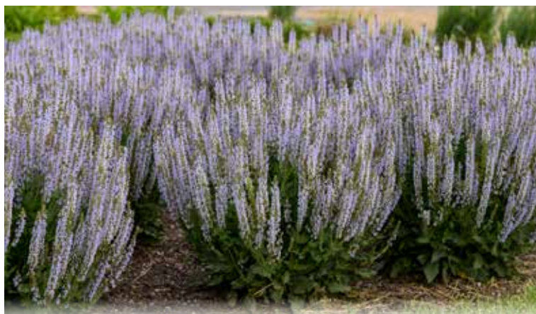
'Perfect Profusion' Salvia nemorosa PP31434 CPBRA