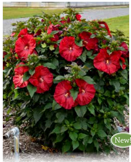
SUMMERIFIC® 'Valentine's Crush' Hibiscus PPAF CPBRA