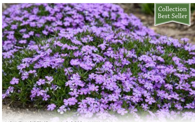
MOUNTAINSIDE™ 'Crater Lake' Phlox PP32990 CPBRAf