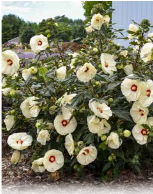
SUMMERIFIC® 'French Vanilla' Hibiscus PP33181 CPBRA