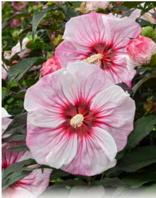
SUMMERIFIC® 'Cherry Choco Latte' Hibiscus PP30738 CPBRA