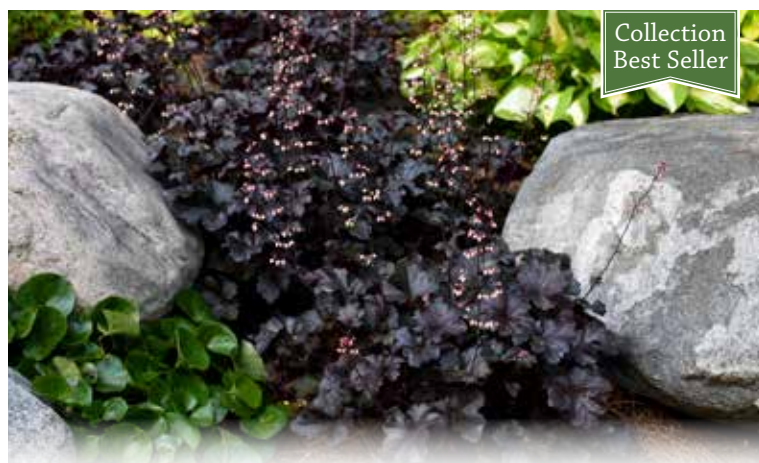
PRIMO® 'Black Pearl' Heuchera PP29395 CPBR5724

PRIMO® 'Wild Rose' – Rose purple foliage. Rosy pink flowers.