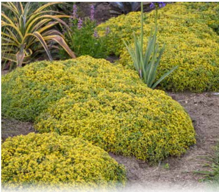
ROCK 'N LOW™ 'Yellow Brick Road' Sedum PP32158 CPBRAf