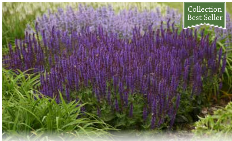
COLOR SPIRES® 'Violet Riot' Salvia nemorosa PP26273 CPBR5337