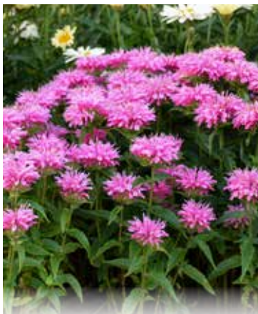
'Pardon My Pink' Monarda PP24244 CPBR5100