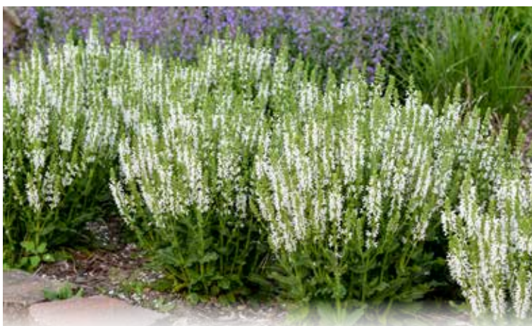
'White Profusion' Salvia nemorosa PPAF CPBRA