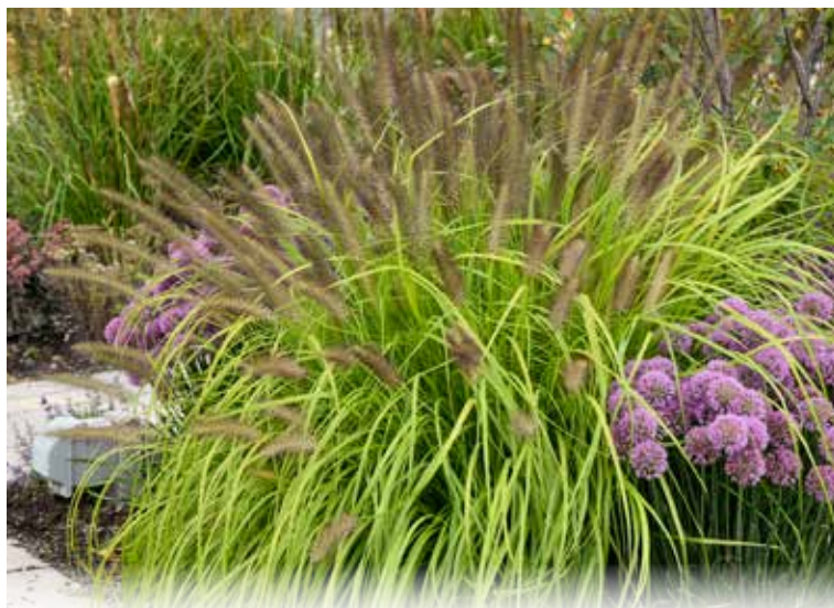
PRAIRIE WINDS® 'Lemon Squeeze' Pennisetum alopecuroides PPAF CPBRAf