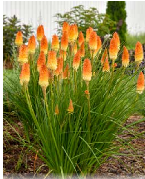
PYROMANIA® 'Hot and Cold' Kniphofia PP31185