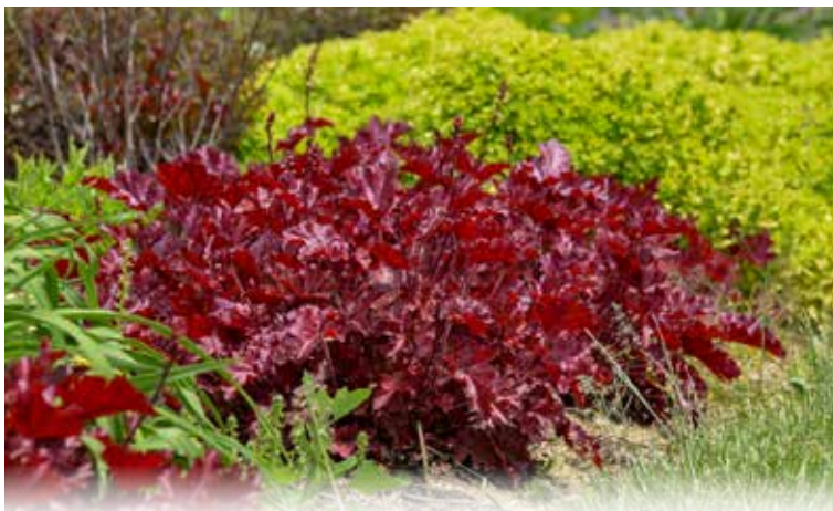
DOLCE® 'Cherry Truffles' Heuchera PP31396 CPBRAf