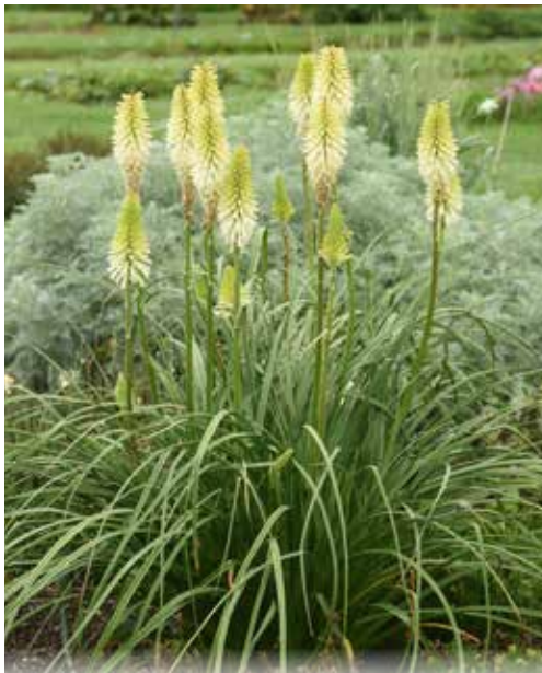
PYROMANIA® 'Flashpoint' Kniphofia PP31282