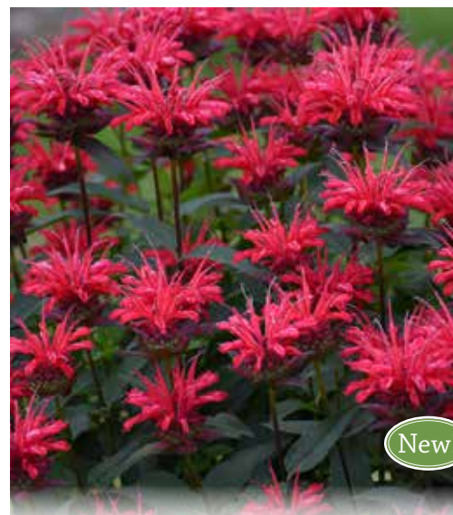
UPSCALE™ 'Red Velvet' Monarda PPAF CPBRAE