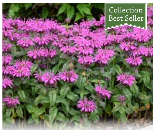
'Leading Lady Plum' Monarda PP26447 CPBR5566