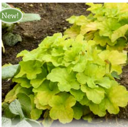
PRIMO® 'Pistachio Ambrosia' Heuchera PPAF CPBRA7