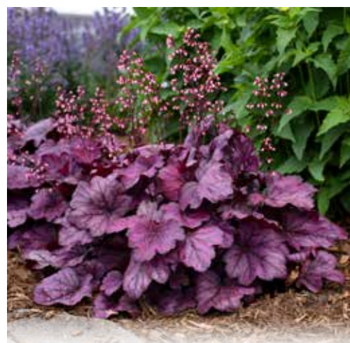
PRIMO® 'Wild Rose' Heuchera PP29923 CPBR5990