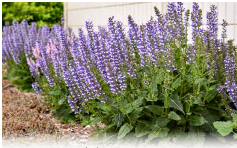
COLOR SPIRES® 'Azure Snow' Salvia PP30534 CPBRAAF