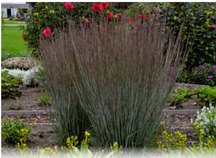
PRAIRIE WINDS® 'Blue Paradise' Schizachyrium scoparium PP28145 PBR5650