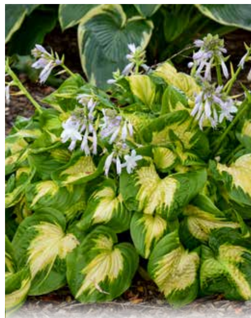
SHADOWLAND® 'Etched Glass' Hosta PP30748 CPBRA7