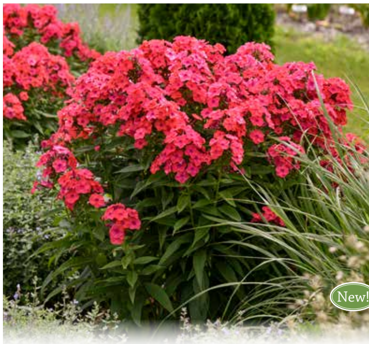
LUMINARY™ 'Sunset Coral' Phlox paniculata PPAF CPBRAf