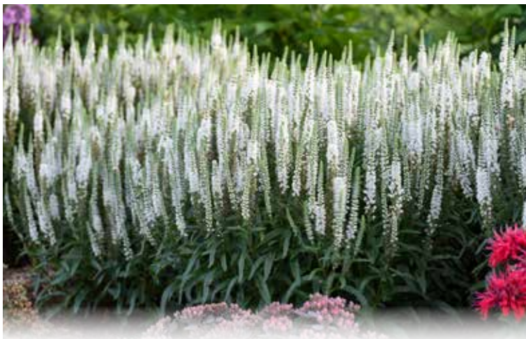
MAGIC SHOW® 'White Wands' Veronica PP27632 CPBR5822