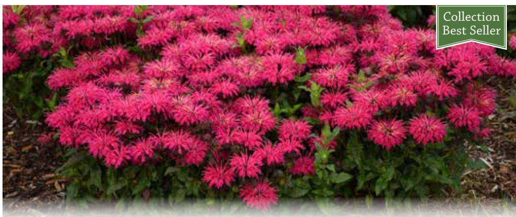
'Leading Lady Razzberry' Monarda PPAF CPBRAf