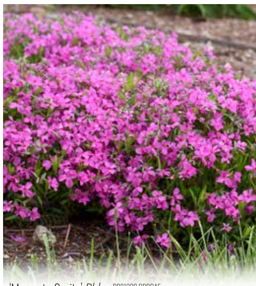
'Magenta Sprite' Phlox PP31239 CPBRAf

SPRING BLING™ 'Ruby Riot' – Reddish pink flowers with darker eyes at center.