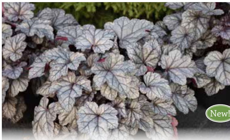
DOLCE® 'Frosted Berry' Heuchera PPAf CPBRAf