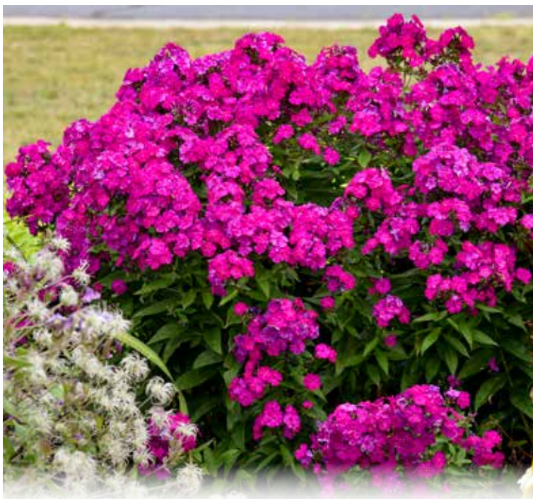
LUMINARY™ 'Ultraviolet' Phlox paniculata PPAF CPBRAf