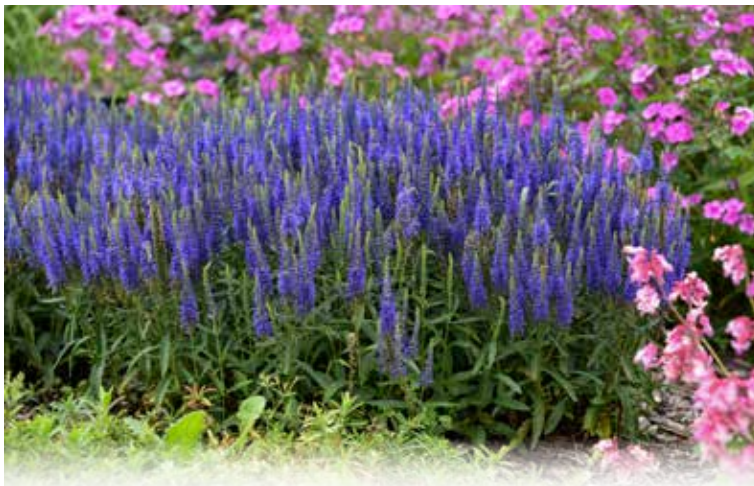
MAGIC SHOW® 'Wizard of Ahhs' Veronica PP31044 CPBRAf