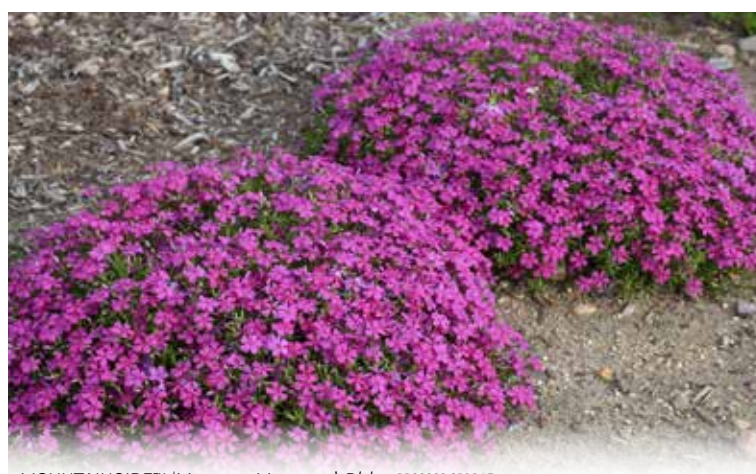
MOUNTAINSIDE™ 'Majestic Magenta' Phlox PP33006 CPBRAf