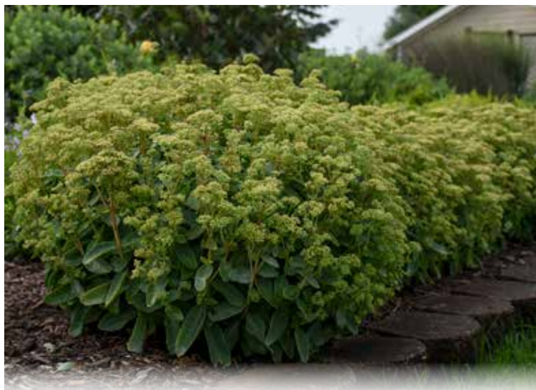
ROCK 'N GROW® 'Lemonjade' Sedum PP26448 CPBR5334