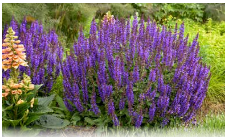
'Violet Profusion' Salvia nemorosa PP31467 CPBRA