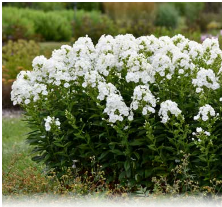
LUMINARY™ 'Backlight' Phlox paniculata PPAF CPBRAf