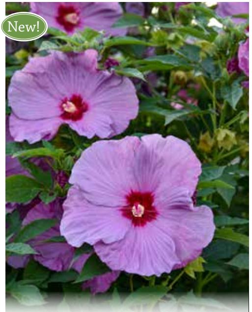
SUMMERIFIC® 'Lilac Crush' Hibiscus PPAF CPBRA