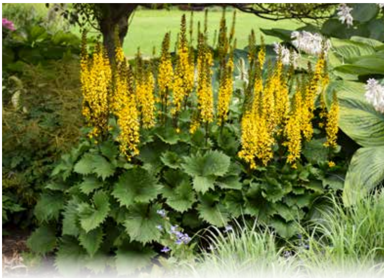
'Bottle Rocket' Ligularia PP24486 CPBR5649

Exposure: Full Sun | Blooms: Early Summer to Early Fall Zone: 5-9 | Height: 12-18" | Space: 12-18"