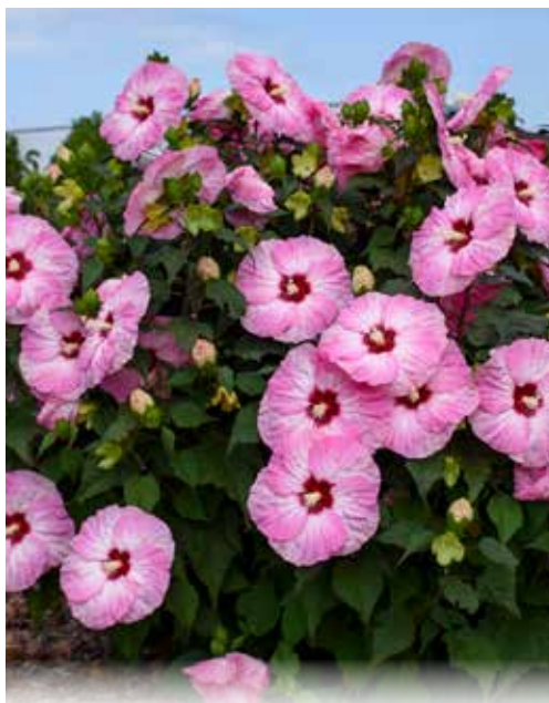
SUMMERIFIC® 'Spinderella' Hibiscus PP33309 CPBRA