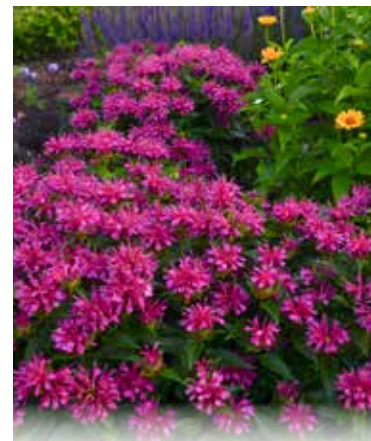
'Pardon My Purple' Monarda PP22170 CPBR5101