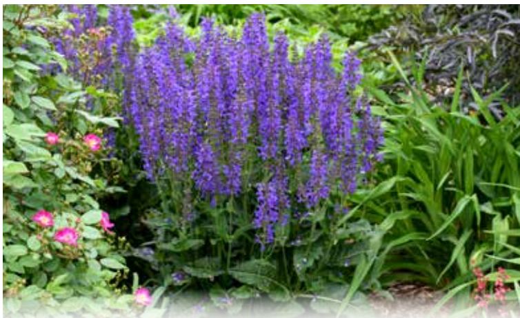
COLOR SPIRES® 'Indiglo Girl' Salvia PP31254 CPBRA