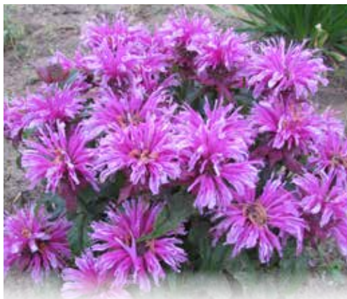
'Leading Lady Orchid' Monarda PP33132 CPBRAf