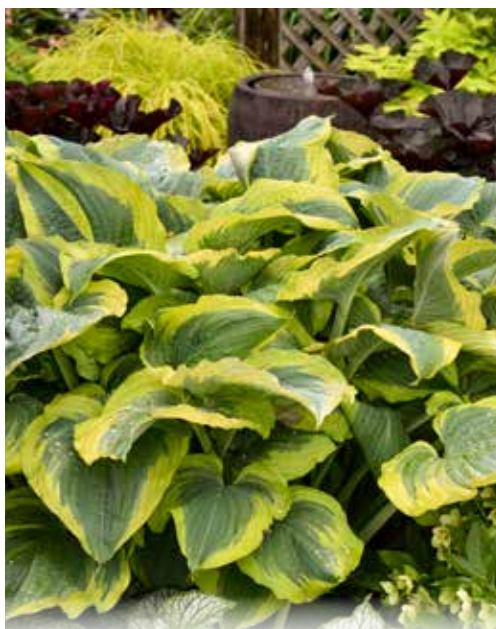
SHADOWLAND® 'Seducer' Hosta PP22413