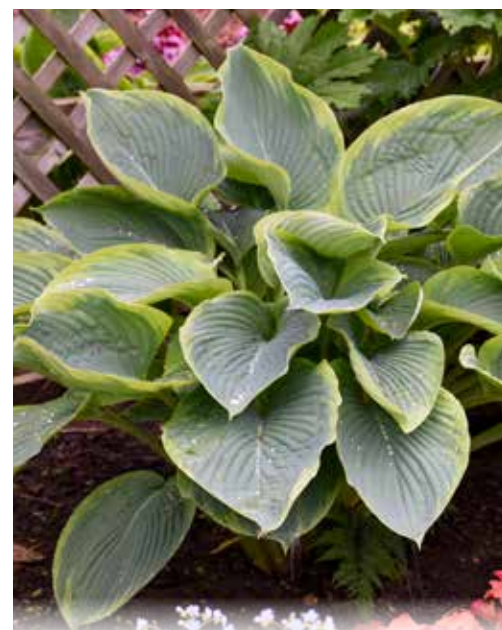
SHADOWLAND® 'Wu-La-La' Hosta PP31309 CPBRAf