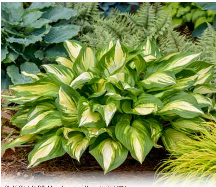
SHADOWLAND® 'Miss America' Hosta PP32068 CPBRAf