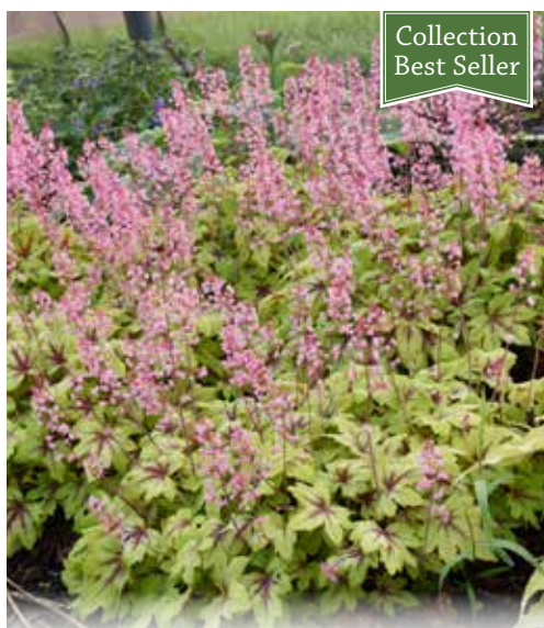
FUN AND GAMES® 'Eye Spy' Heucherella PP30532 CPBR6260

DRESSED UP™ 'Evening Gown' – Huge glossy black leaves with ruffled margins.