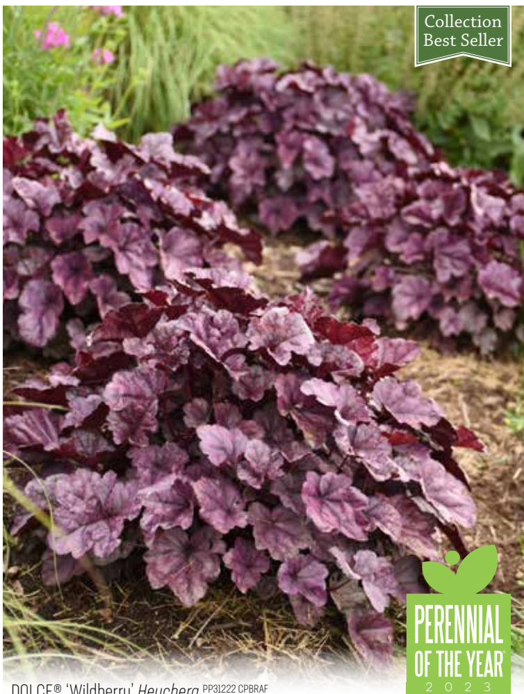
DOLCE® 'Wildberry' Heuchera PP31222 CPBRAf