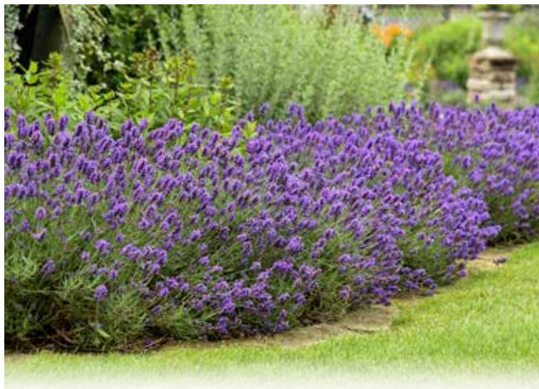
SWEET ROMANCE® Lavandula angustifolia ('Kerlavangem' PP23001 CPBR4906)