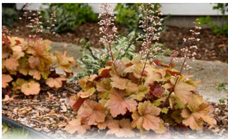
DOLCE® 'Toffee Tart' Heuchera PPAf CPBRAf