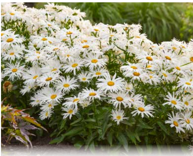
AMAZING DAISIES® 'Spun Silk' Leucanthemum superbum PPAF CPBRAf