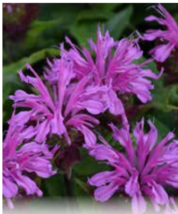
'Pardon My Lavender II' Monarda PPAF CPBRA5