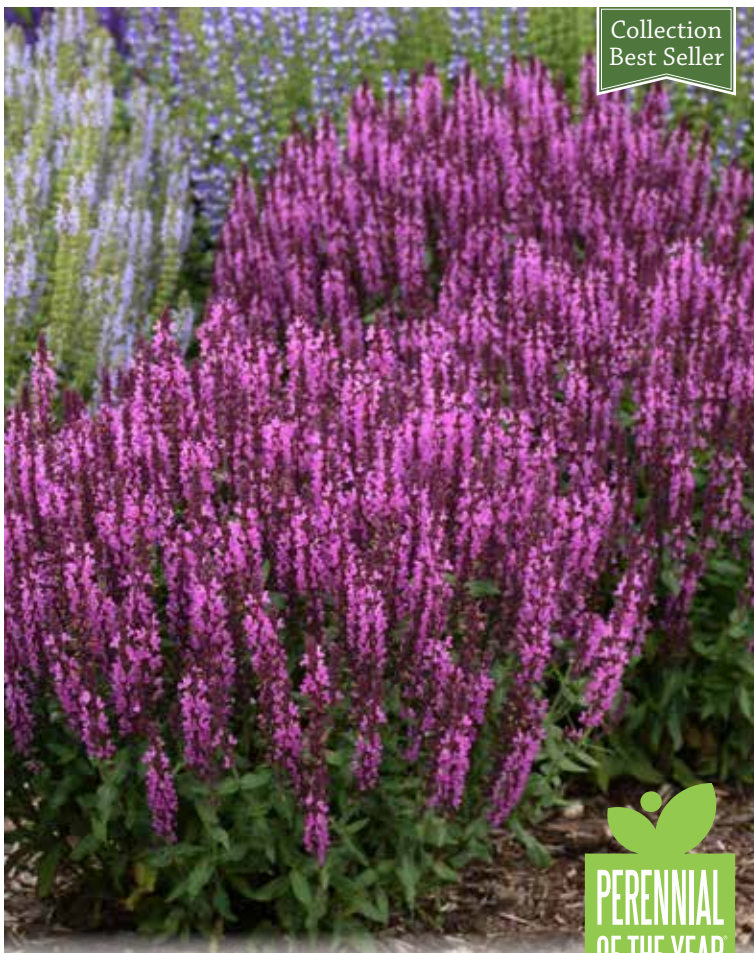
'Pink Profusion' Salvia nemorosa PP31435 CPBRA