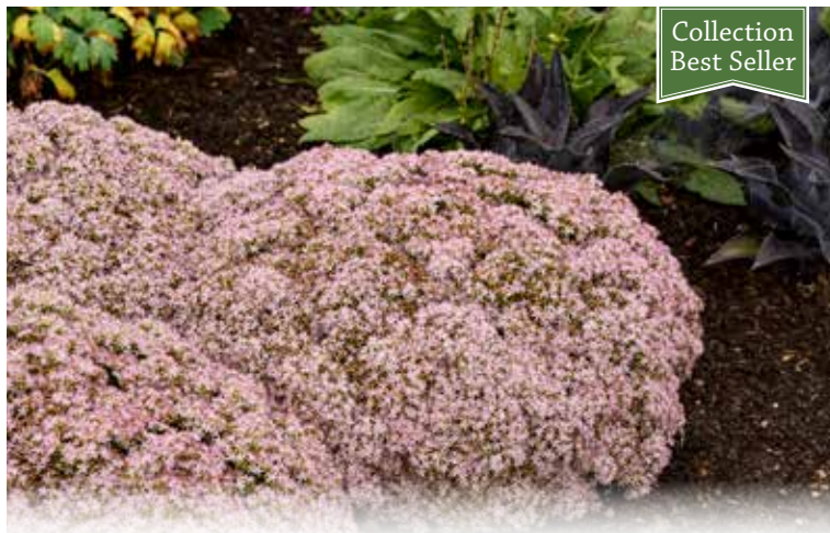
ROCK 'N ROUND™ 'Pure Joy' Sedum PP24194 CPBR5340