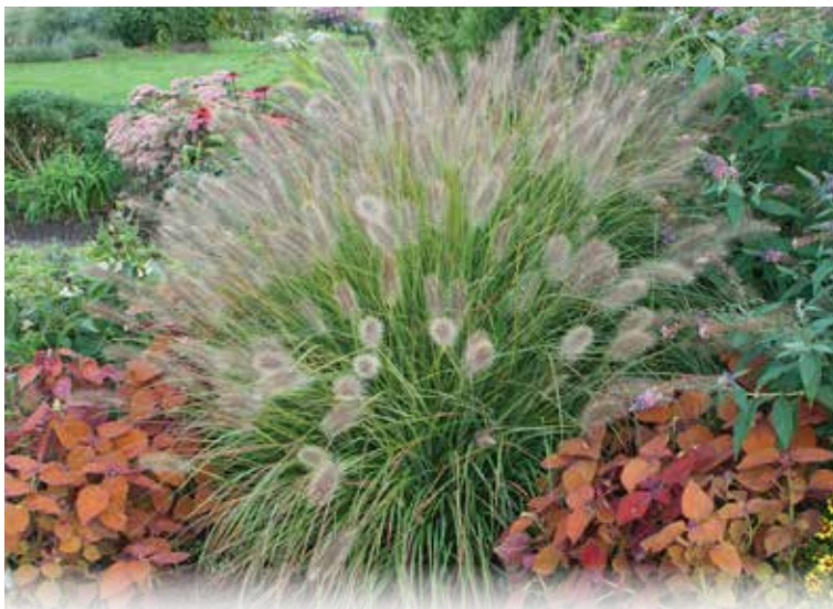
PRAIRIE WINDS® 'Desert Plains' Pennisetum alopecuroides PP20751