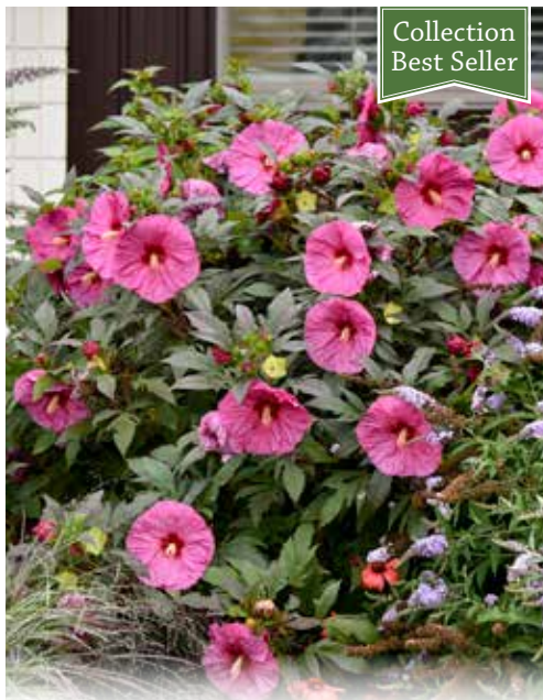
SUMMERIFIC® 'Berry Awesome' Hibiscus PP27936 CPBR5647