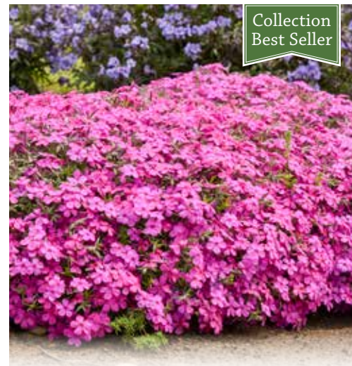
SPRING BLING™ 'Ruby Riot' Phlox subulata PPAf CPBRAf