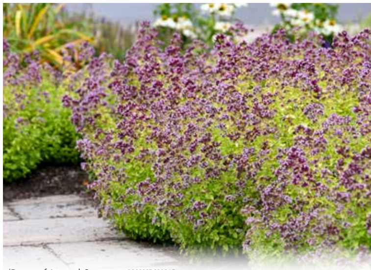
'Drops of Jupiter' Origanum PP33367 CPBRAf