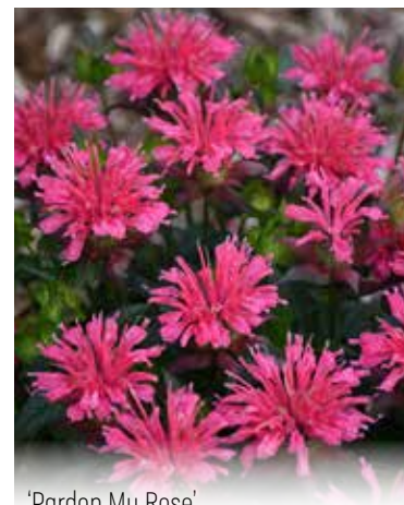
'Pardon My Rose' Monarda PPAF CPBRA5

'Pardon My Rose' – Intense rose pink flowers.