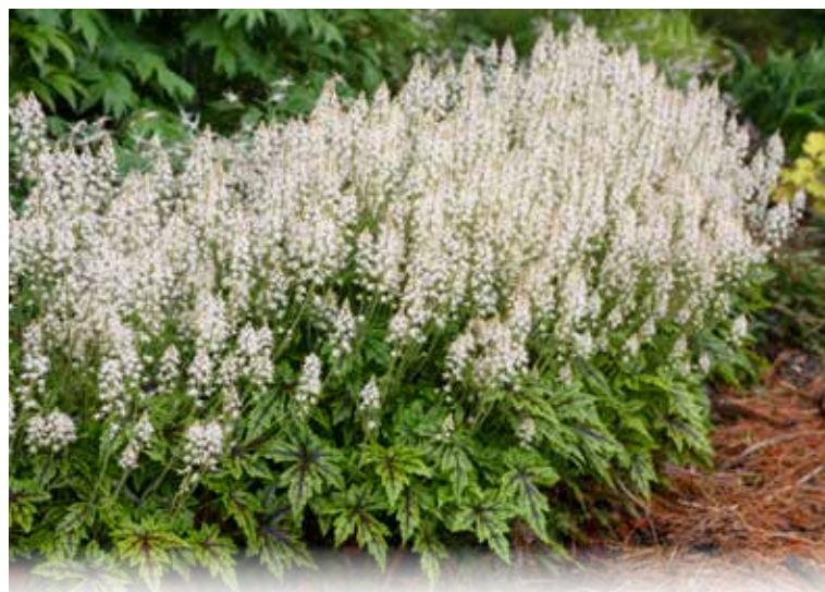
'Cutting Edge' Tiarella PP29745 CPBR6258

ROCK 'N LOW™ 'Yellow Brick Road' – Low spreading groundcover with red stems, fine green leaves, and yellow flowers.