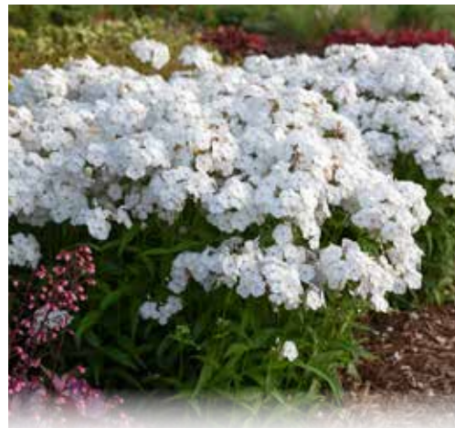
'Opening Act White' Phlox PP27461 CPBR5992