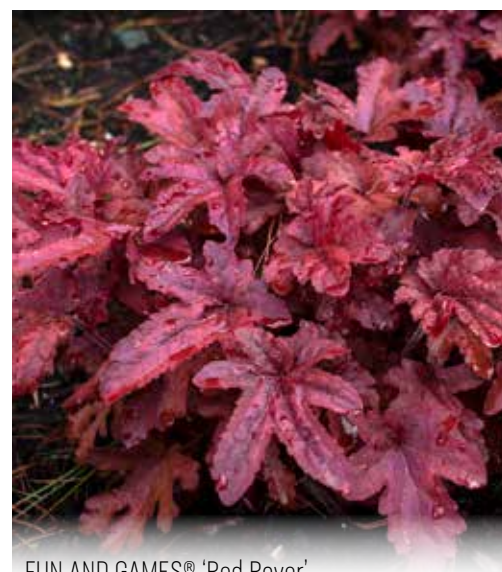
FUN AND GAMES® 'Red Rover' Heucherella PP28751 CPBR5819