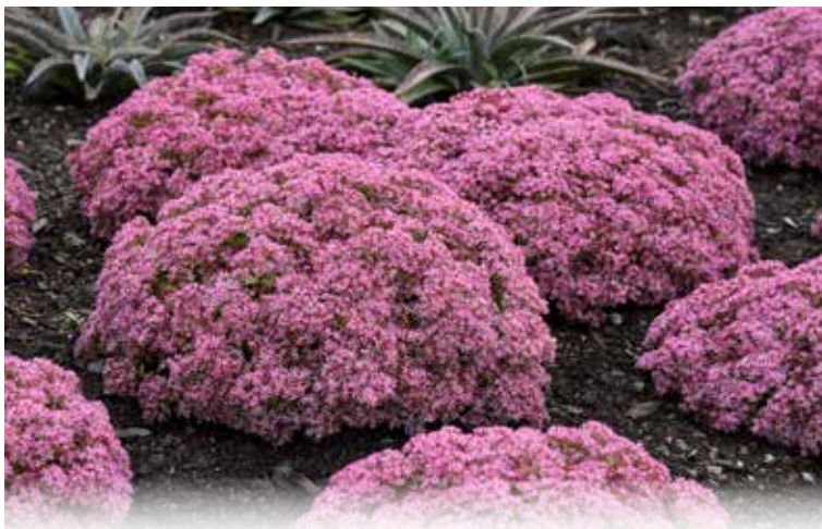
ROCK 'N ROUND™ 'Pride and Joy' Sedum PP32530 CPBRAf