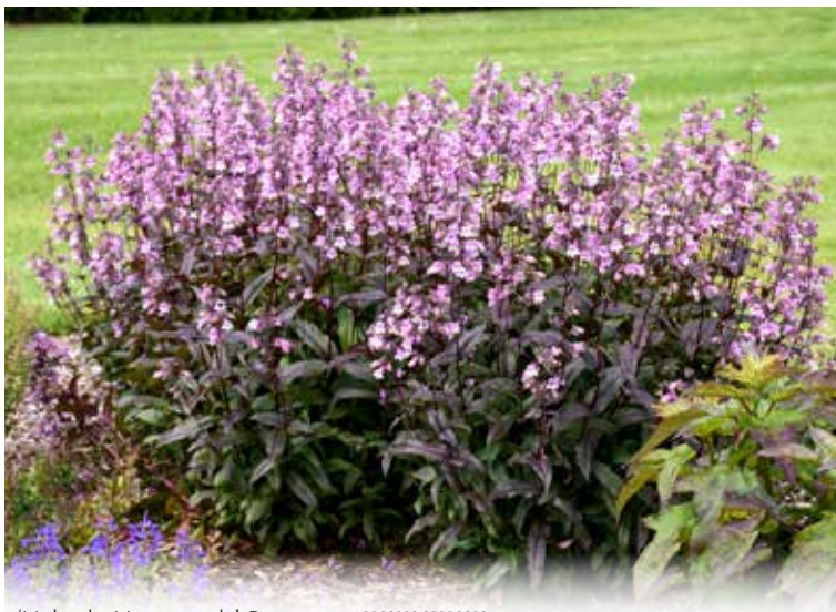
'Midnight Masquerade' Penstemon PP29603 CPBR6262

Exposure: Full Sun | Blooms: Midsummer to Early Fall Zone: 4-9 | Height: 24" | Space: 36"