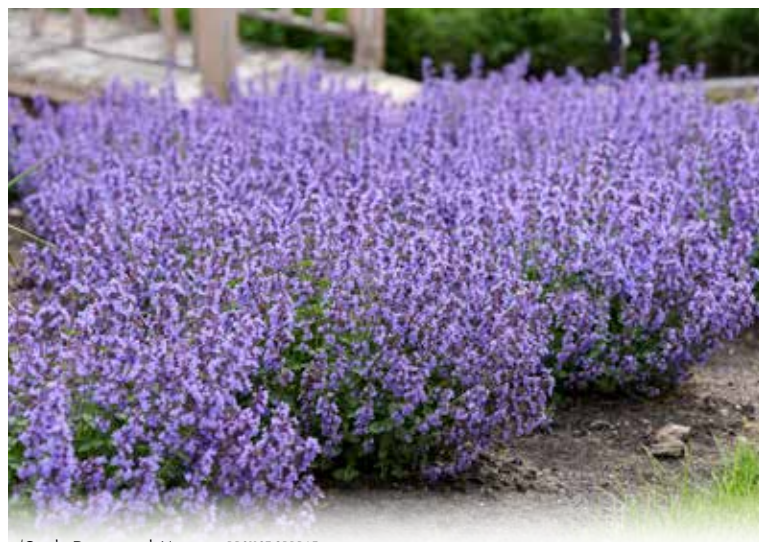
'Cat's Pajamas' Nepeta PP31127 CPBRA5