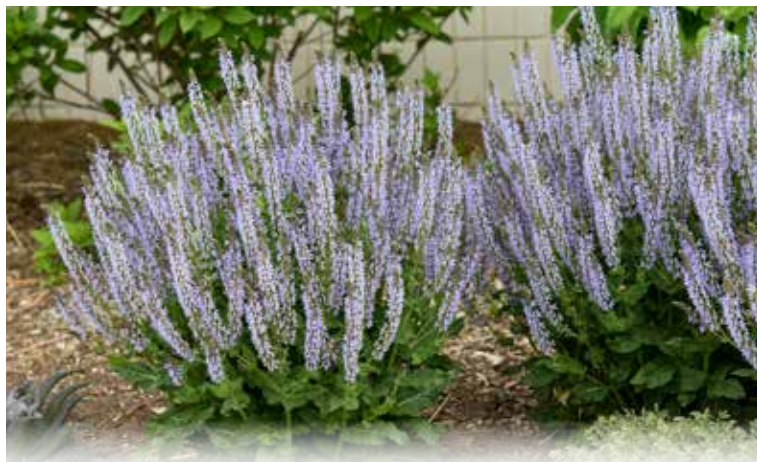
COLOR SPIRES® 'Crystal Blue' Salvia nemorosa PP26344 CPBR5338