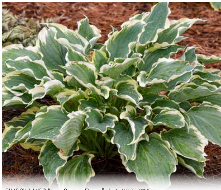
SHADOWLAND® 'Hope Springs Eternal' Hosta PP33266 CPBRAf