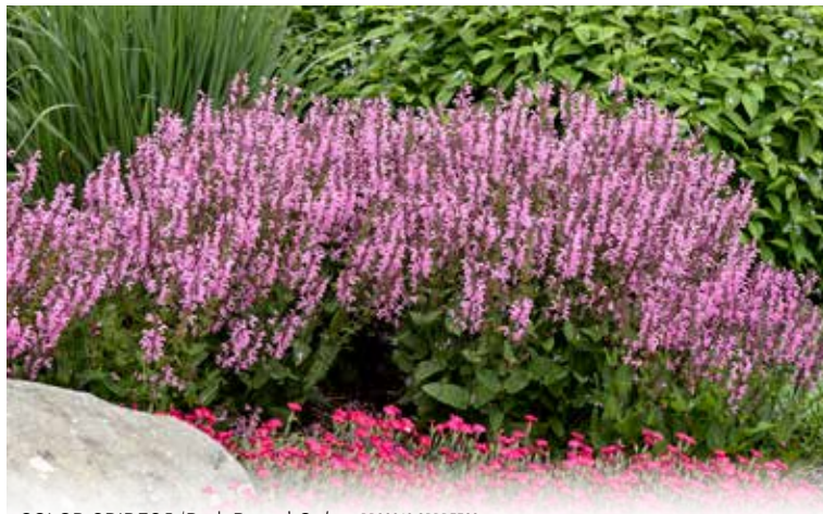
COLOR SPIRES® 'Pink Dawn' Salvia PP26343 CPBR5569