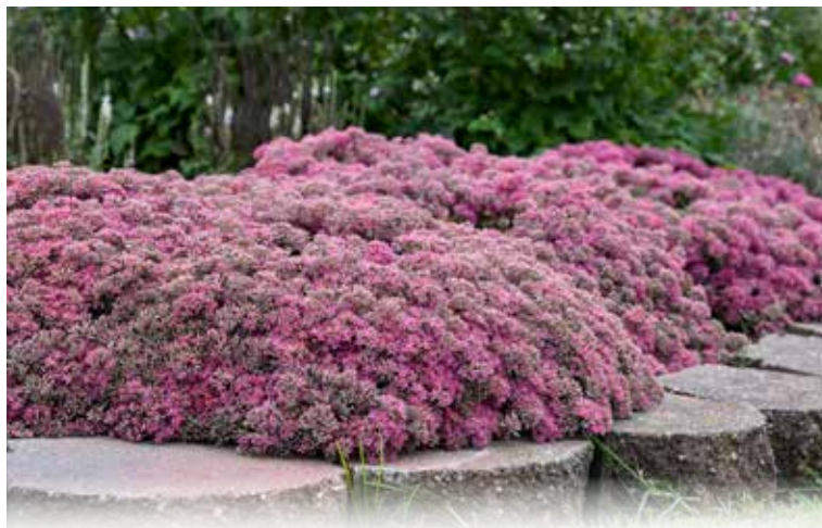
ROCK 'N ROUND™ 'Popstar' Sedum PP31228 CPBR6264