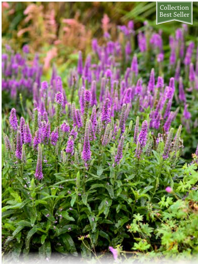
MAGIC SHOW® 'Purple Illusion' Veronica PP31301 CPBRAf