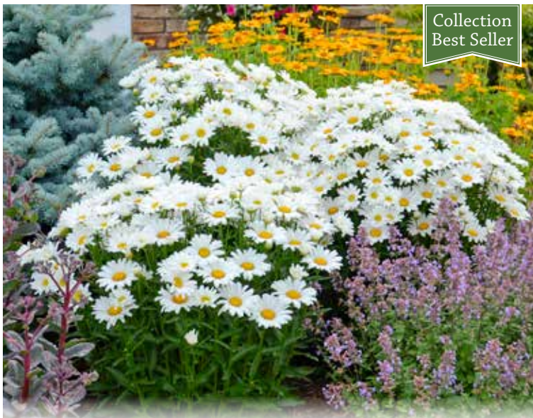
AMAZING DAISIES® DAISY MAY® Leucanthemum superbum (Daisy Duke PP21914 CPBR4376)