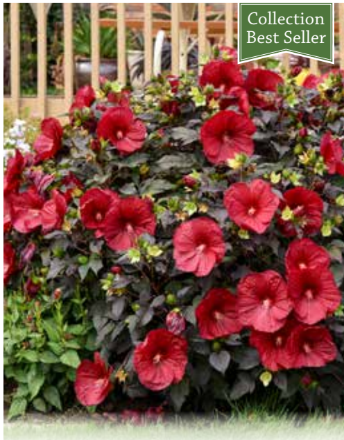
SUMMERIFIC® 'Holy Grail' Hibiscus PP31478 CPBRA