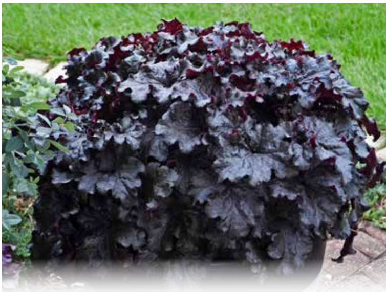
DRESSED UP™ 'Evening Gown' Heuchera PPAF CPBRAf