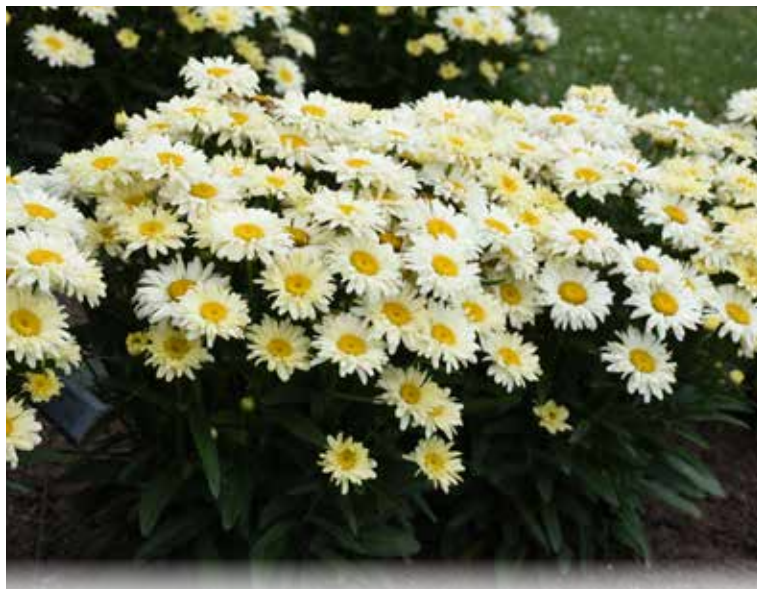
AMAZING DAISIES® 'Banana Cream II' Leucanthemum superbum PPAF CPBRAf