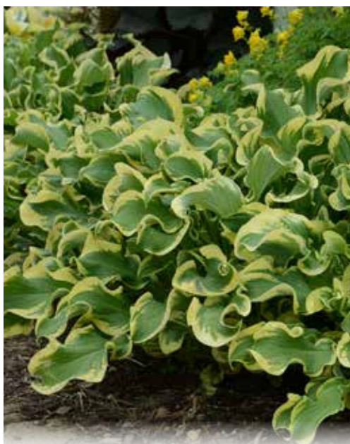
SHADOWLAND® 'Wheee!' Hosta PP23565 CPBR4948