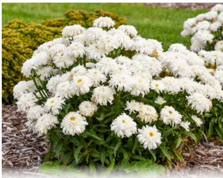
AMAZING DAISIES® 'Marshmallow' Leucanthemum superbum PPAF CPBRAf