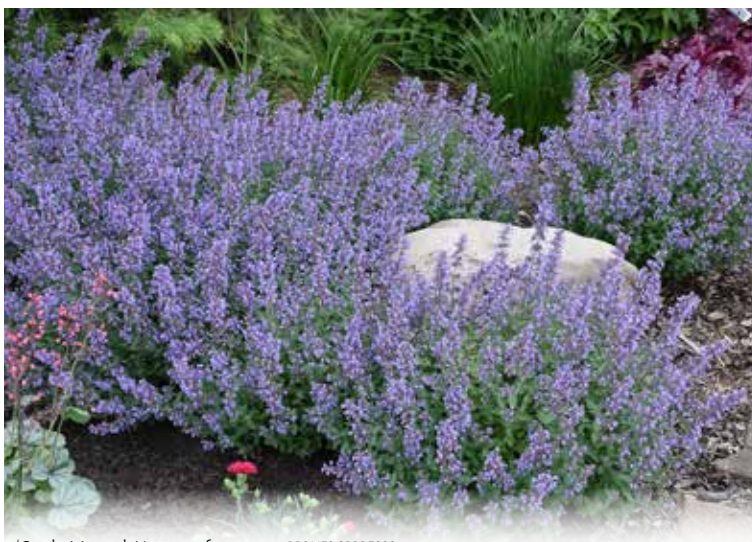
'Cat's Meow' Nepeta faassenii PP24472 CPBR5098

Exposure: Full Sun | Blooms: Early Summer to Early Fall Zone: 3-8 | Height: 12-14" | Space: 18-20"