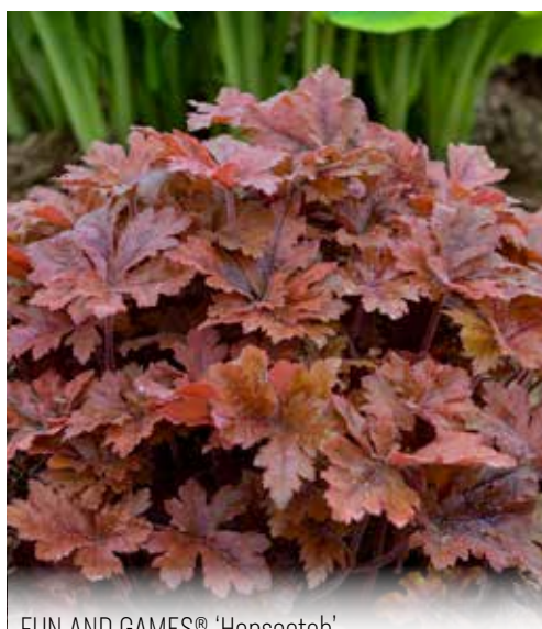
FUN AND GAMES® 'Hopscotch' Heucherella PP28750 CPBR5818