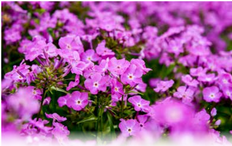
'Opening Act Romance' Phlox PPAF CPBRAf