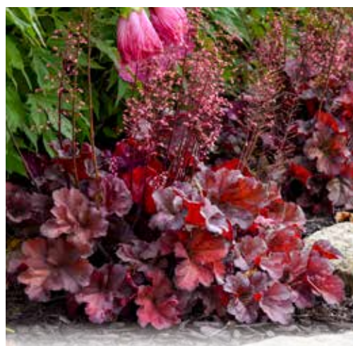
PRIMO® 'Mahogany Monster' Heuchera PP31395 CPBRA7