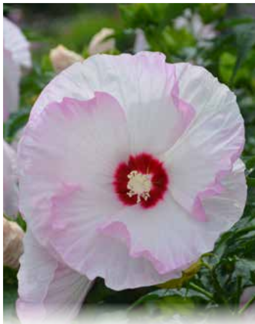
SUMMERIFIC® 'Ballet Slippers' Hibiscus PP29896 CPBR5820