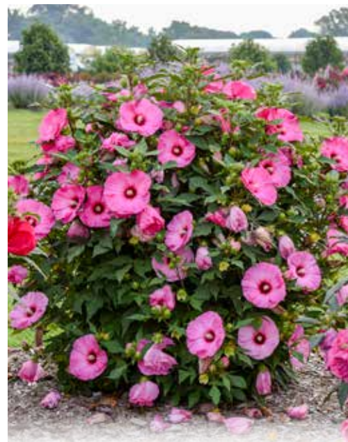
SUMMERIFIC® 'Candy Crush' Hibiscus PP32587 CPBRA5