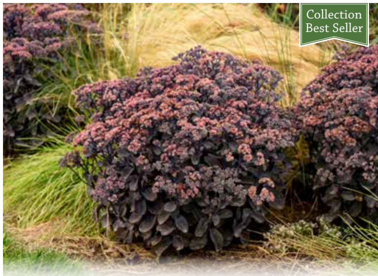
ROCK 'N GROW® 'Back in Black' Sedum PPAF CPBRA