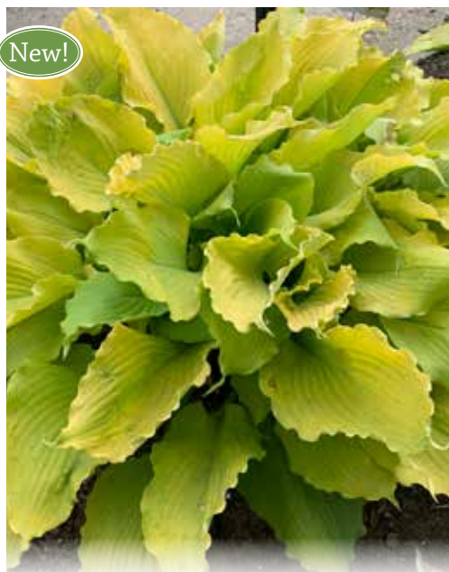
SHADOWLAND® 'Echo the Sun' Hosta PPAF CPBRA7