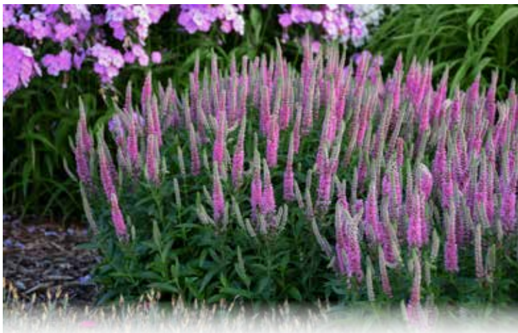
MAGIC SHOW® 'Pink Potion' Veronica PP29681 CPBR5821