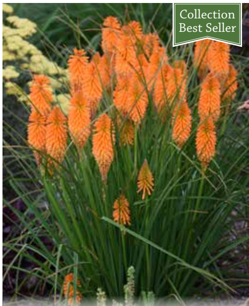
PYROMANIA® 'Orange Blaze' Kniphofia PP31545