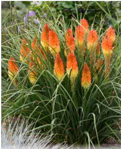
PYROMANIA® 'Backdraft' Kniphofia PP31424