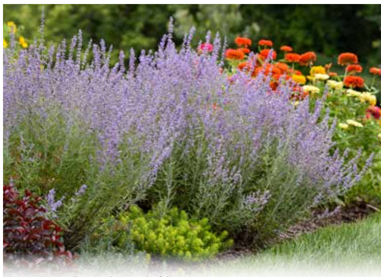
'Denim 'n Lace' Perovskia atriplicifolia PP28445 CPBR5568

Exposure: Full Sun | Blooms: Early Summer Zone: 3-8 | Height: 36-40" | Space: 28-32"