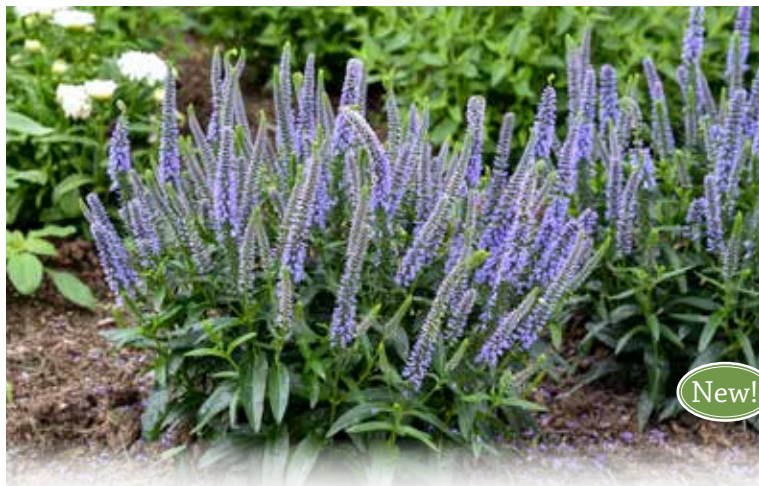
MAGIC SHOW® 'Ever After' Veronica PPAF CPBRAf