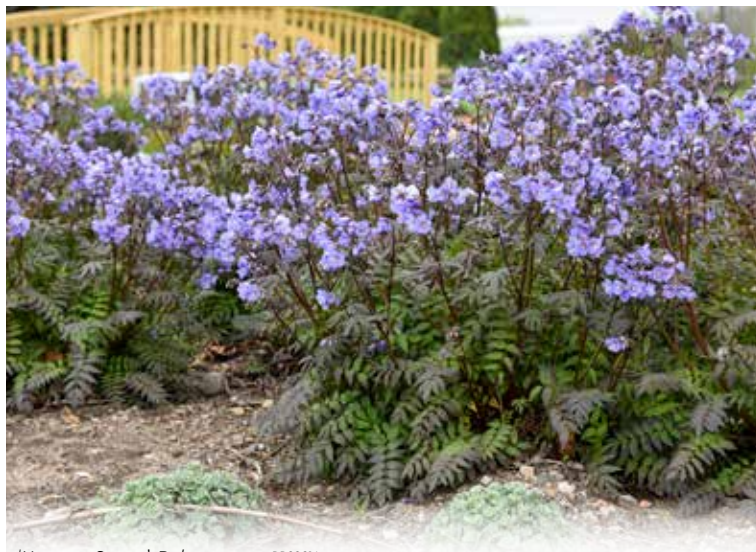
'Heaven Scent' Polemonium PP20214

Exposure: Full Sun | Blooms: Early to Late Summer, Rebloomer Zone: 4-8 | Height: 28" | Space: 42"