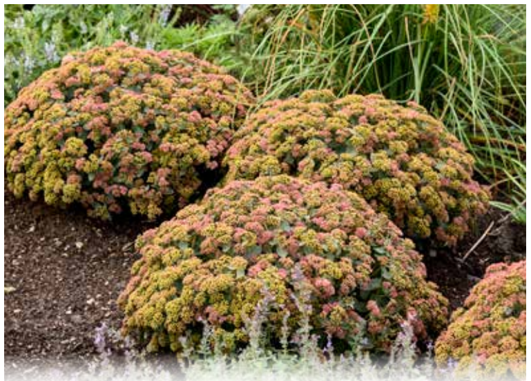
ROCK 'N GROW® 'Coraljade' Sedum PPAF CPBRA