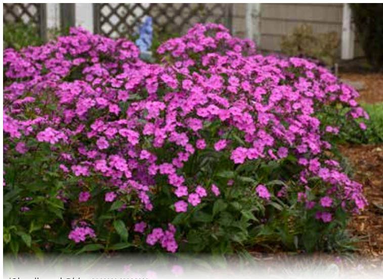
'Cloudburst' Phlox PP30289 CPBR6263