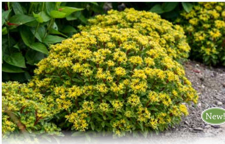
ROCK 'N ROUND™ 'Bright Idea' Sedum PP4F CPBRAf