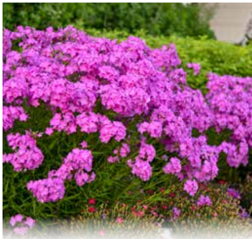
'Opening Act Ultrapink' Phlox PP32093 CPBRAf