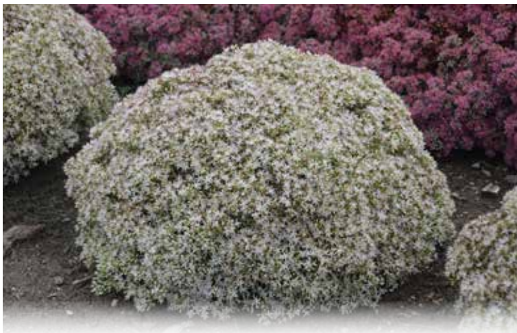
ROCK 'N ROUND™ 'Bundle of Joy' Sedum PP30808 CPBRAf