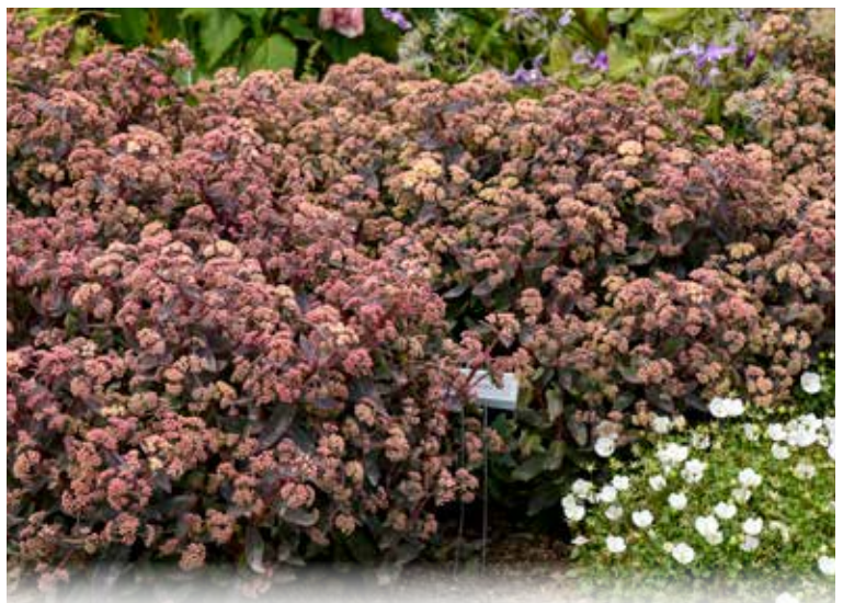
ROCK 'N GROW® 'Tiramisu' Sedum PPAF CPBRA