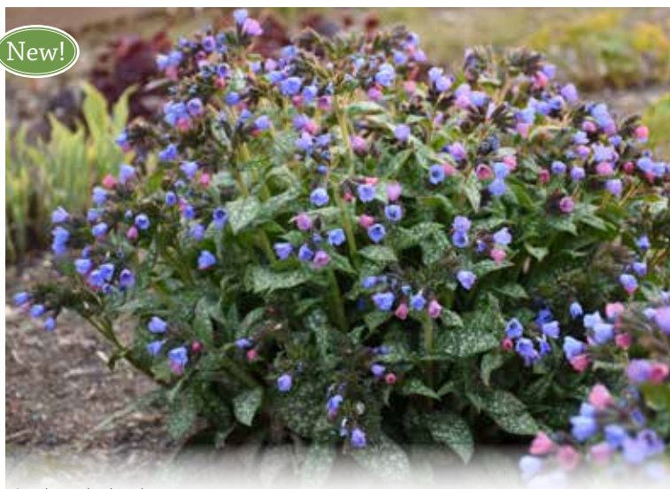
'Pink-a-Blue' Pulmonaria PPAF CPBRAE

Exposure: Full Sun to Part Shade | Blooms: Late Spring Zone: 3-7 | Height: 18-24" | Space: 15-18"