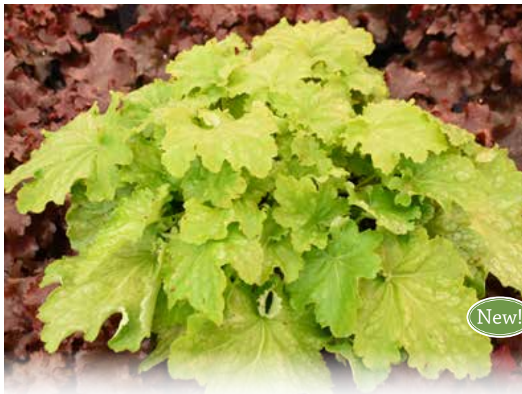
DRESSED UP™ 'Ball Gown' Heuchera PPAF CPBRAf