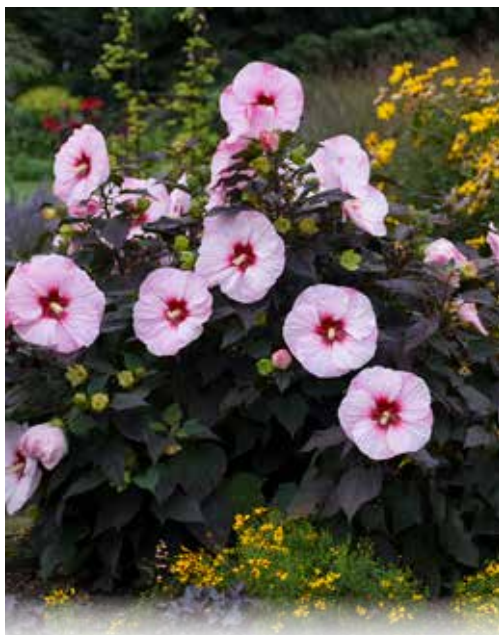
SUMMERIFIC® 'Perfect Storm' Hibiscus PP27880 CPBR5648