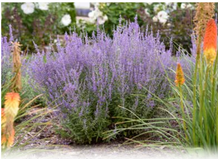
'Sage Advice' Perovskia atriplicifolia PP33310 CPBRAf

Exposure: Full Sun | Blooms: Midsummer to Mid Fall Zone: 4-9 | Height: 28-32" | Space: 34-38"