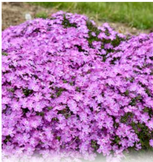
SPRING BLING™ 'Rose Quartz' Phlox subulata PP33315 CPBRAf