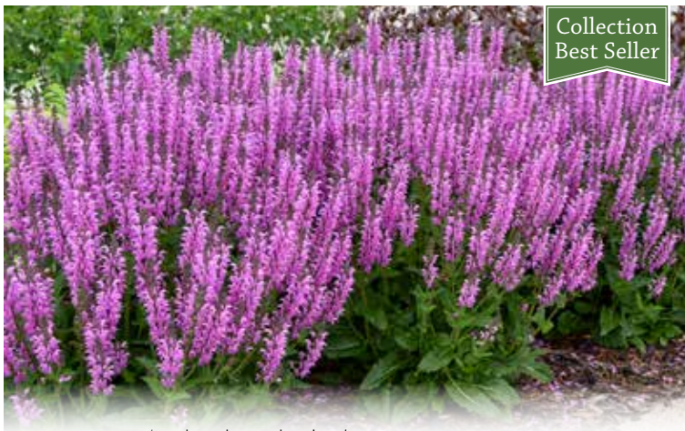
COLOR SPIRES® 'Back to the Fuchsia' Salvia PP32920 CPBRAAF