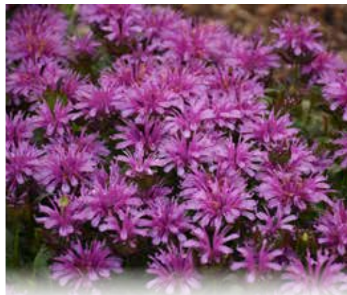
'Leading Lady Amethyst' Monarda PPAF CPBRAf