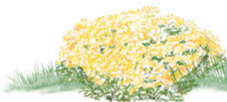
ROCK 'N LOW™