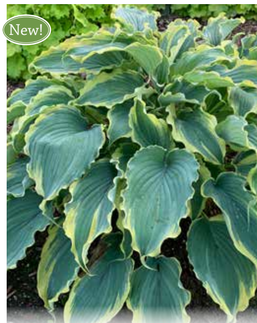
SHADOWLAND® 'Voices in the Wind' Hosta PP33265 CPBRAf