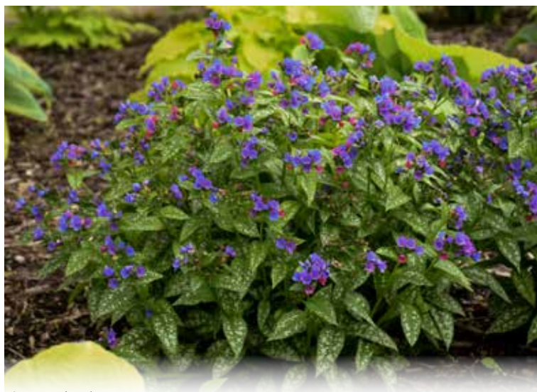
'Spot On' Pulmonaria PP33063 CPBRAE

Exposure: Part to Full Shade | Blooms: Late Spring Zone: 3-9 | Height: 16-18" | Space: 22-24"