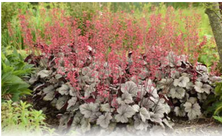
DOLCE® 'Silver Gumdrop' Heuchera PP29207 CPBR5989