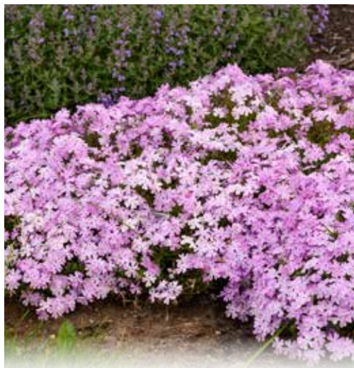
SPRING BLING™ 'Pink Sparkles' Phlox subulata PP33276 CPBRAf