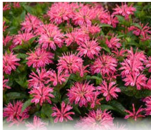
'Leading Lady Pink' Monarda PPAF CPBRAf