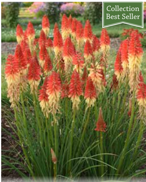
PYROMANIA® 'Rocket's Red Glare' Kniphofia PP30772