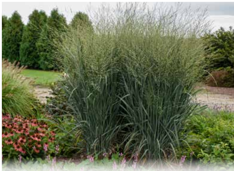
PRAIRIE WINDS® 'Totem Pole' Panicum virgatum PP29951 CPBRAf