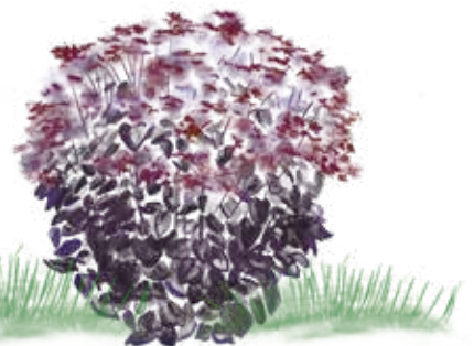
ROCK 'N GROW®